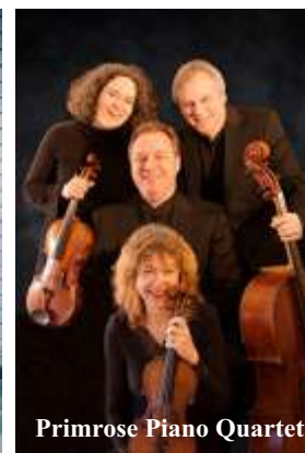
Primrose Piano Quartet